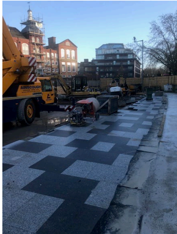
Figure 4 - New granite paving at the Green

We will continue providing written updates like this next year. If you are interested in taking part in a virtual Community Liaison Group one evening in January, please let us know by emailing nle@tfl.gov.uk with the subject line KENNINGTON GREEN VIRTUAL CLG. We will respond with further information in January.